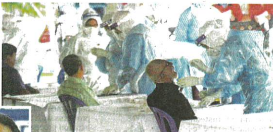
Health workers collecting swab samples in Kuala Terengganu on Wednesday. Concern has grown after 40 Health Ministry personnel were reportedly infected with the Covid-19 virus after receiving both doses of their vaccination.

"The main purpose of the Covid-19 vaccine is to reduce severe symptoms, protect us from death, (reduce the dependency on) ICU (Intensive Care Unit), ventilator etc. Thus reducing the burden on the public health sys-