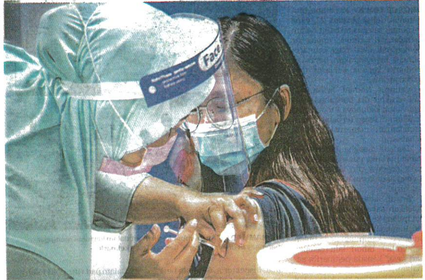
SEORANG Jururawat menyuntik vaksin Covid-19 kepada salah seorang penerima di Pusat Perubatan Universiti Malaya, Lembah Pantai, Kuala Lumpur baru-baru ini.

Sementara itu, bagi fasa kedua yang dijangka bermula bulan ini hingga Ogos tahun ini pula mem-