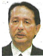
Dr Noor Hisham Abdullah

Semalam, KKM melaporkan tiga kluster jangkitan COVID-19 membabitkan institusi pendidikan/sekolah dikesan di Sarawak, Selangor dan Putrajaya.