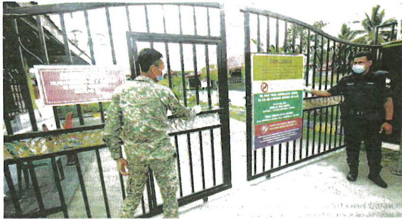
PASUKAN keselamatan mengawal ketat pintu masuk Sekolah Menengah Ugama (SMU) (Arab) Tarblah Diniah Tahfiz Bunut Sarang, Tumpat ekoran penutupan sekolah terbabit semalam.

Menurut Zaini, bilangan warga sekolah yang dikesan positif Co-