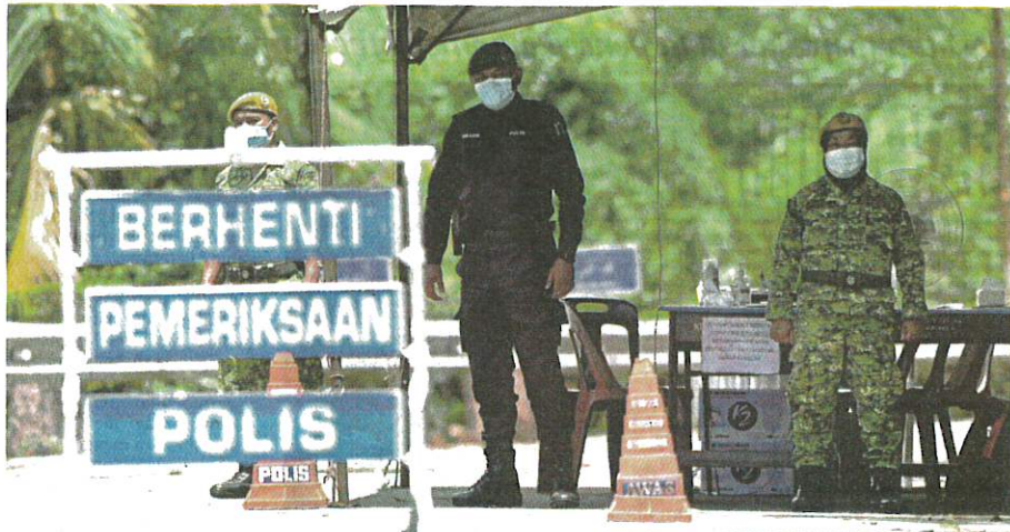
ANGGOTA polis bersama Rela membuat kawalan di laluan keluar masuk ke Sekolah Menengah Agama Kota Kinabalu yang dikenakan Perintah Kawalan Pergerakan Diperketatkan (PKPD) bermula semalam sehingga 1 Mei.

Menurutnya, jumlah kes sembuh semalam pula 1,427 menjadikan kes kumulatif